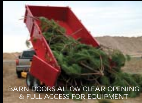
BARN DOORS ALLOW CLEAR OPENING & FULL ACCESS FOR EQUIPMENT