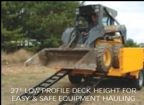
27" LOW PROFILE DECK HEIGHT FOR EASY & SAFE EQUIPMENT HAULING