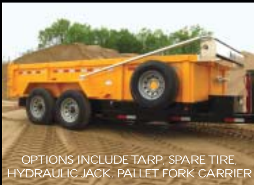
OPTIONS INCLUDE TARP, SPARE TIRE, HYDRAULIC JACK, PALLET FORK CARRIER