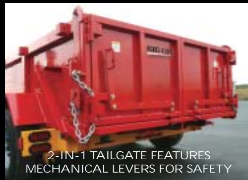
2-IN-1 TAILGATE FEATURES MECHANICAL LEVERS FOR SAFETY