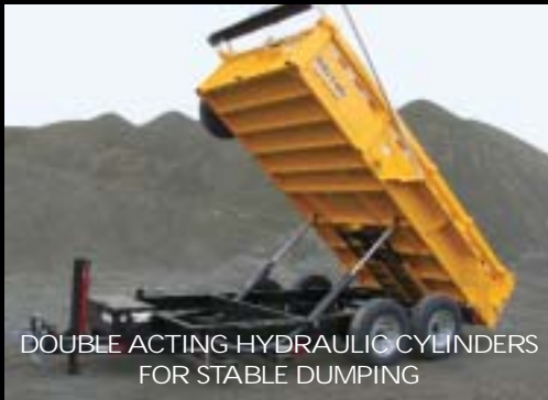
DOUBLE ACTING HYDRAULIC CYLINDERS FOR STABLE DUMPING